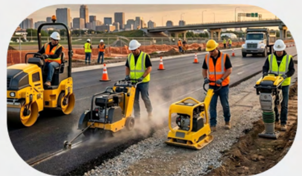
Road Construction Machinery